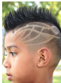
No mohawks, "faux" hawks or shaved designs