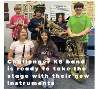
Challenger K8 band is ready to take the stage with their new instruments

Schools throughout HCSD are sharing the ways in which millage funds, approved by voters in 2020, are enhancing a wide variety of school programs, increasing student and staff safety and offering competitive salaries for recruitment across all positions. Millage funds have been used to add 9 school guardians to all middle schools, high schools as well as larger campuses. All schools with bands and music programs have received all new instruments and uniforms! Additional safety equipment for athletics and programs such as Powell's Taekwondo have also been provided to all schools.