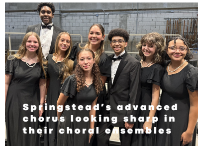
Springstead's advanced chorus looking sharp in their choral ensembles