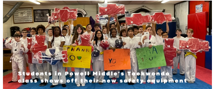
Students in Powell Middle's Taekwondo class shows off their new safety equipment