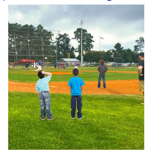
AGENCY individuals know that access is their right