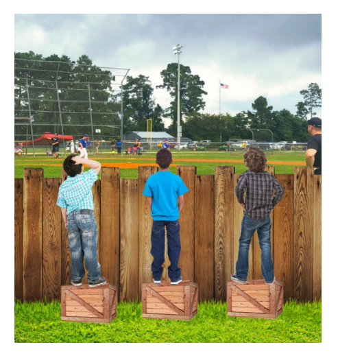
EQUALITY requires a level playing field that doesn't yet exist