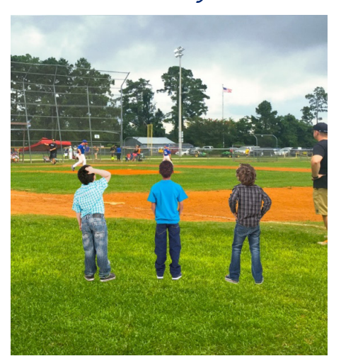
JUSTICE eliminates systemic barriers

The journey starts by asking those affected how they see and are impacted by the conditions, rules, and resources.