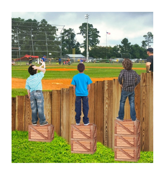
EQUITY acknowledges systemic impediments with targeted fixes

The journey starts by asking those affected how they see and are impacted by the conditions, rules, and resources.